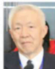
P. R. China Vice-President