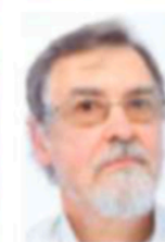
France Secretary General