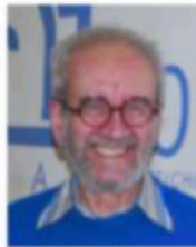
Austria Honorary President